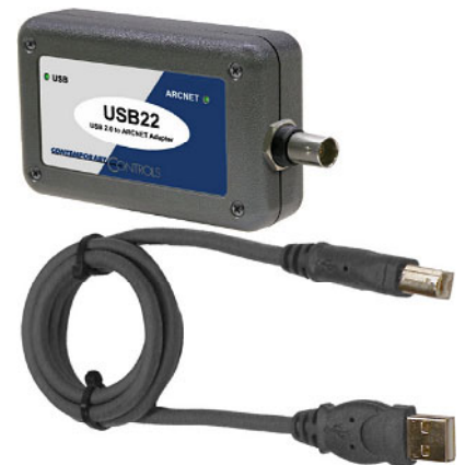
The USB22 NIM is frequently used in applications including data acquisition, machine control, and process control.

The USB22 is RoHS compliant and will be available in May 2006. Models begin at $295.